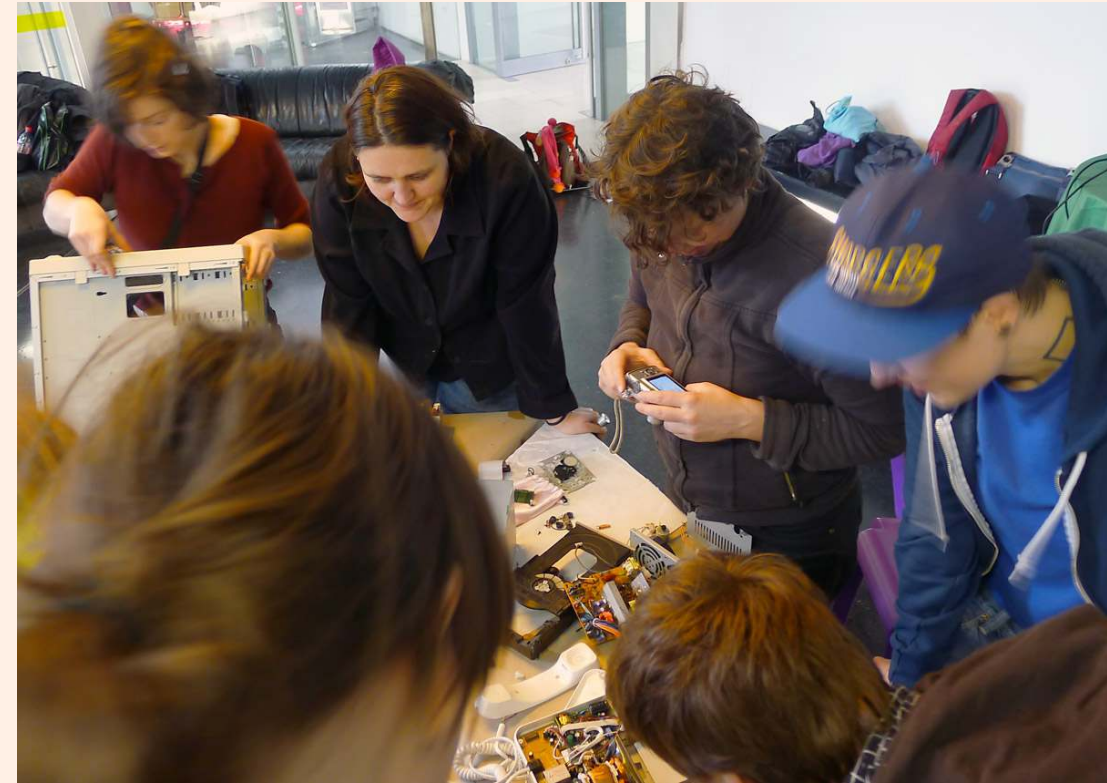
Workshop in Vienna at Museumsquartier, Raum D, festival "Make Me! Napravi Me!"

“I was part of a mobility program in 2005 that has changed my life a lot, because I had the chance to go to Syria for half a year and study in Damascus University, and went also a lot to Lebanon [...], it really changed my perspective about marginalization and forms of othering.”